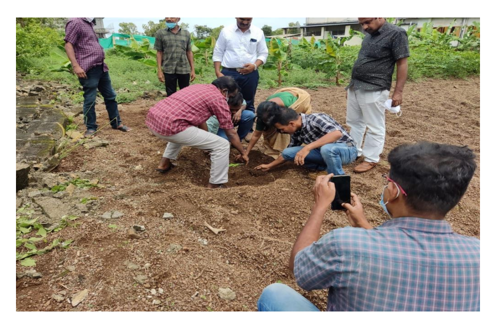
Tree plantation programme in association with forest department