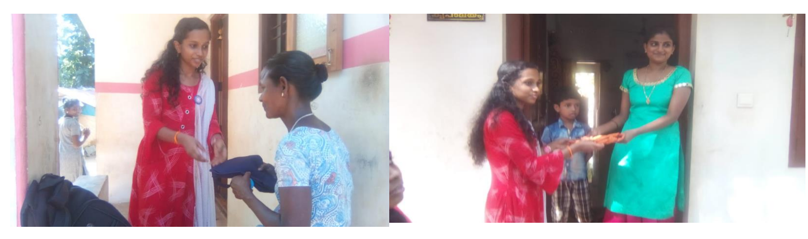
Cloth bag distribution. 15 students participated in the programme.