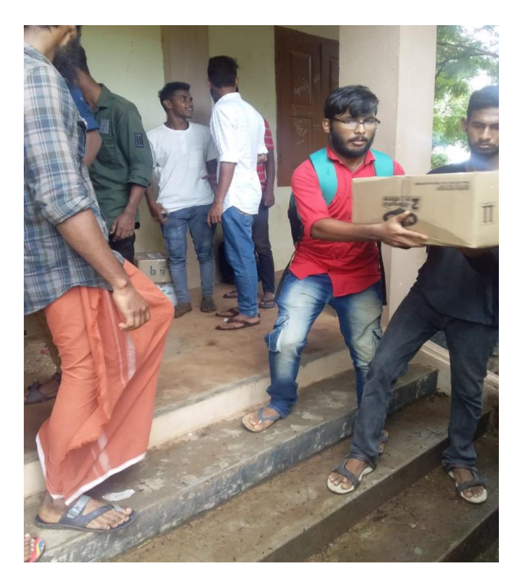
Flood relief activities 2019.