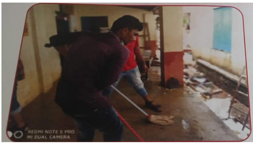
Flood relief operations - August 2018. 20 members participated in the programme.