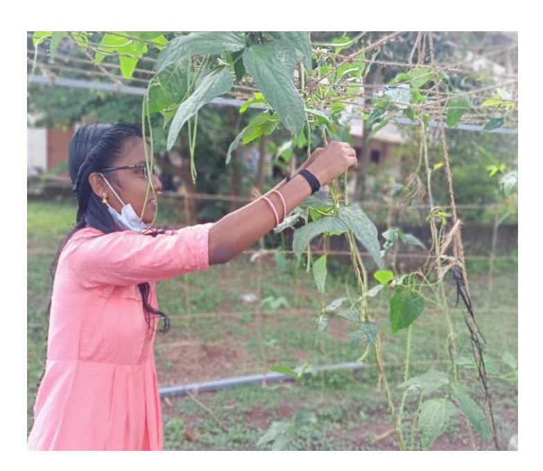
Vegetable garden at college campus.