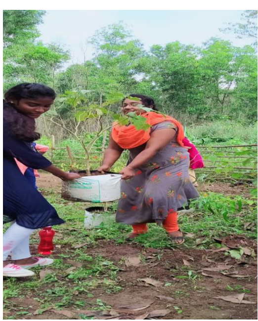
Campus cleaning and vegetable garden formation.