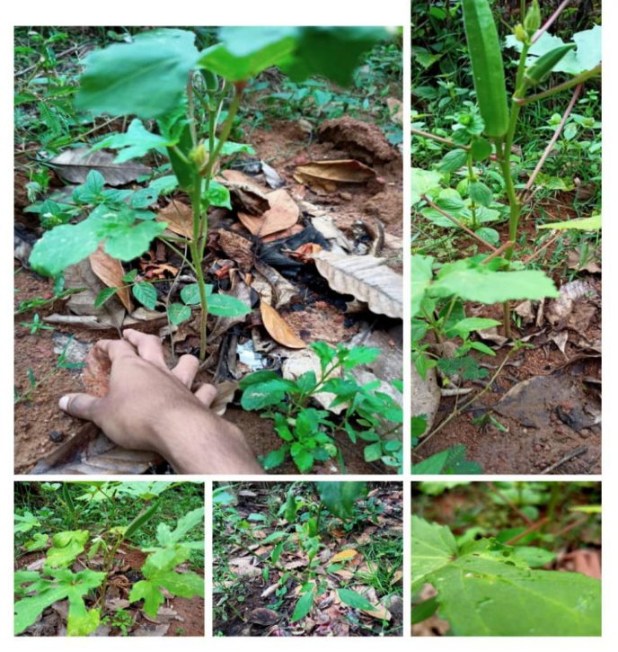
Tree plantation programmes at home as part of Wold Environment Day.