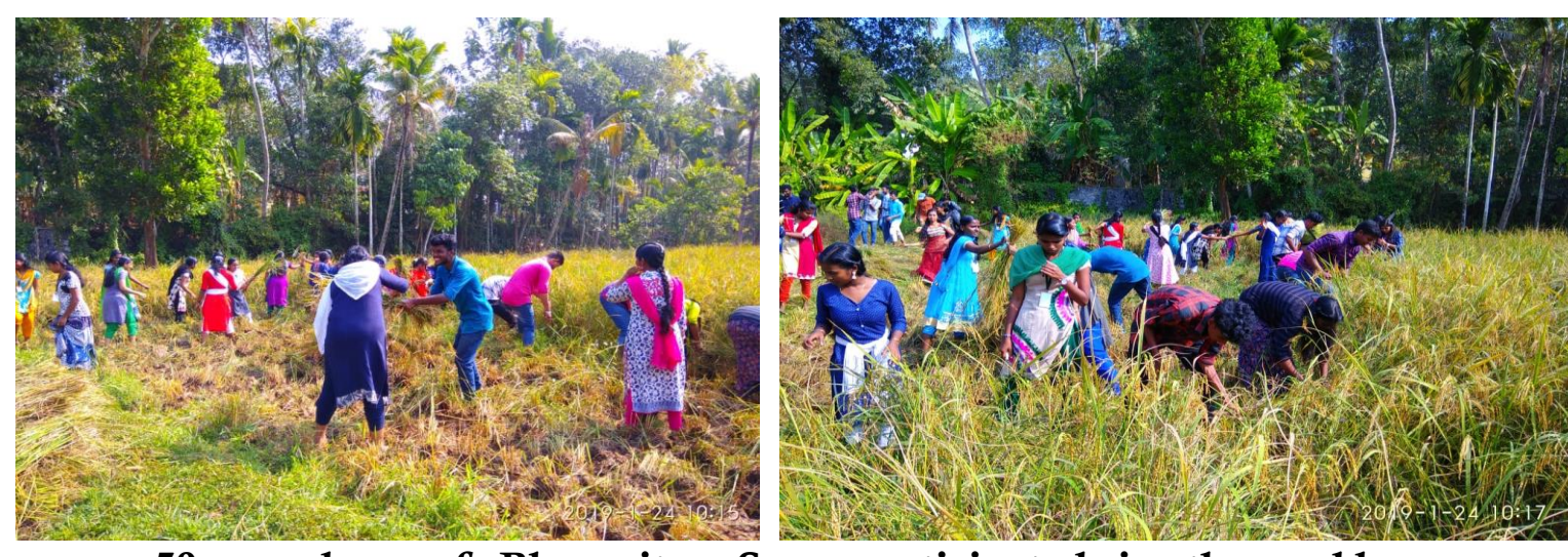
50 members of Bhoomitra Sena participated in the paddy harvesting at adopted village.