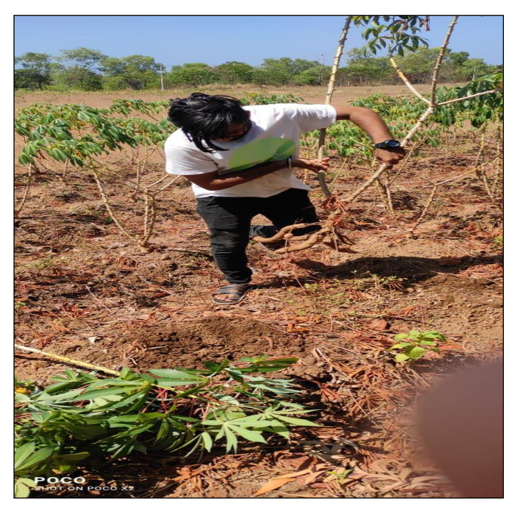
TAPPIOCA CULTINATION BY STUDENTS

As Kollam DIC identified Tapioca as product to be included in "ONE DISTICT ONE PRODUCT SHEME", that is why the ED Club of our college in association with NSS Create value added product like tapioca powder, tapioca chips etc. and conducted sale to teachers and students.