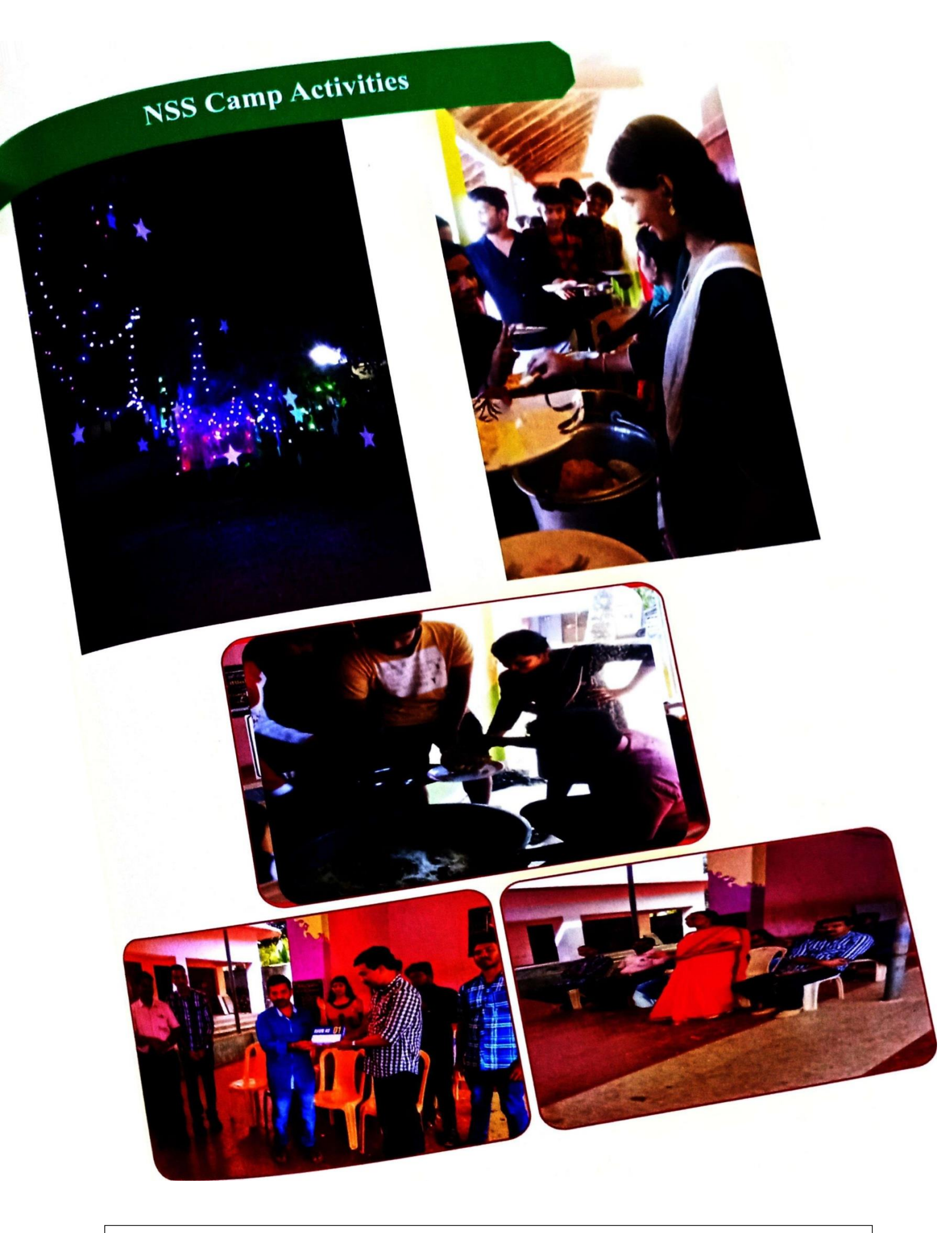
Annual seven day camp activities