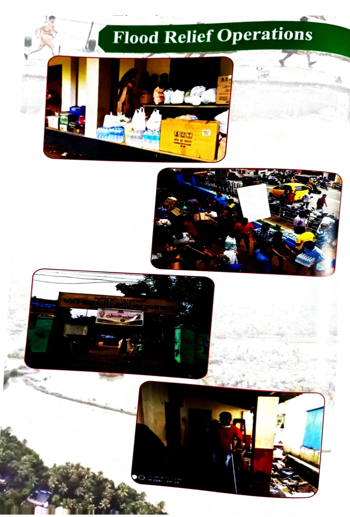
Floodrelief operations of NSS unit