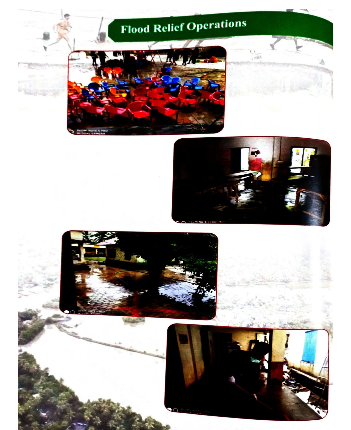
Flood relief operation conducted by NSS unit