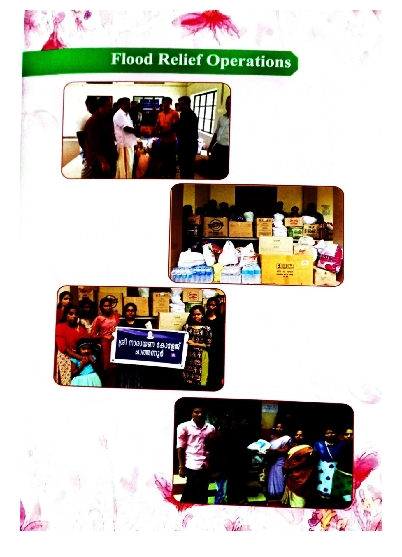
Floodrelief operations conducted by NSS unit