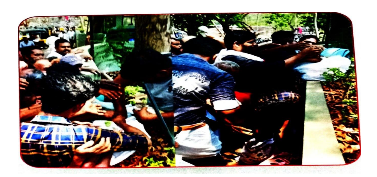
Food donation of NSS unit at RCC ,Trivandrum