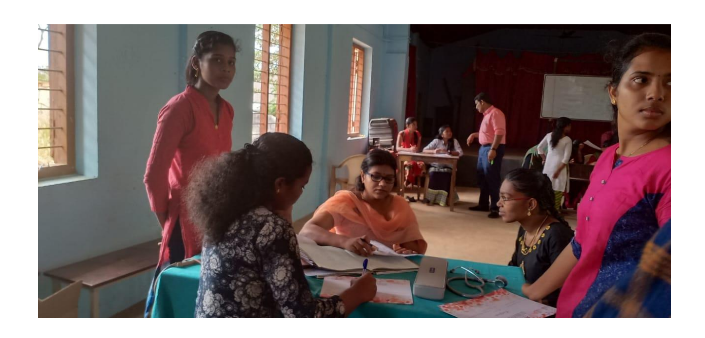
Taking pledge to stand united against AIDS