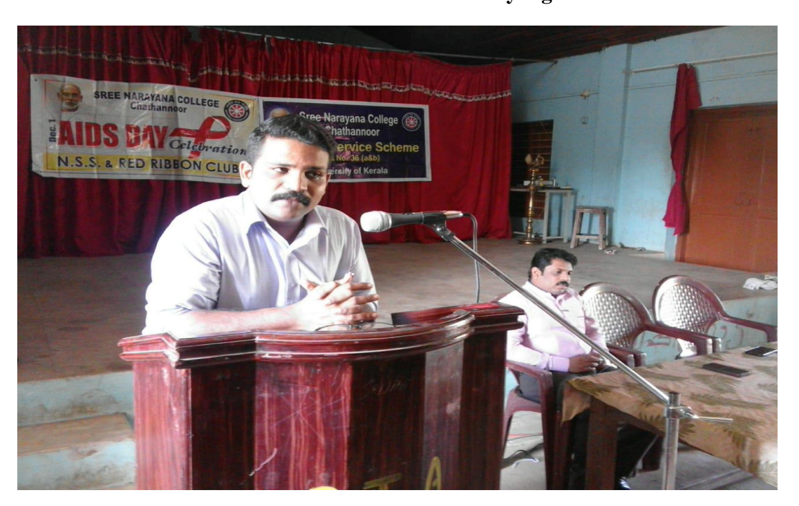
RED RIBBON CLUB