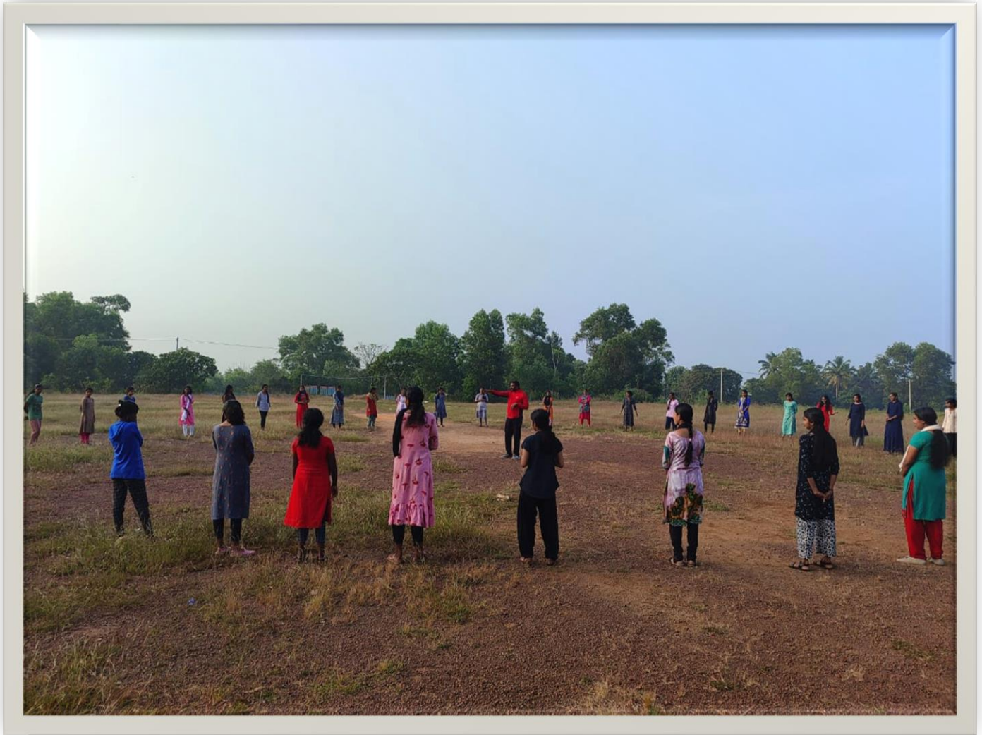
Ground Practice session