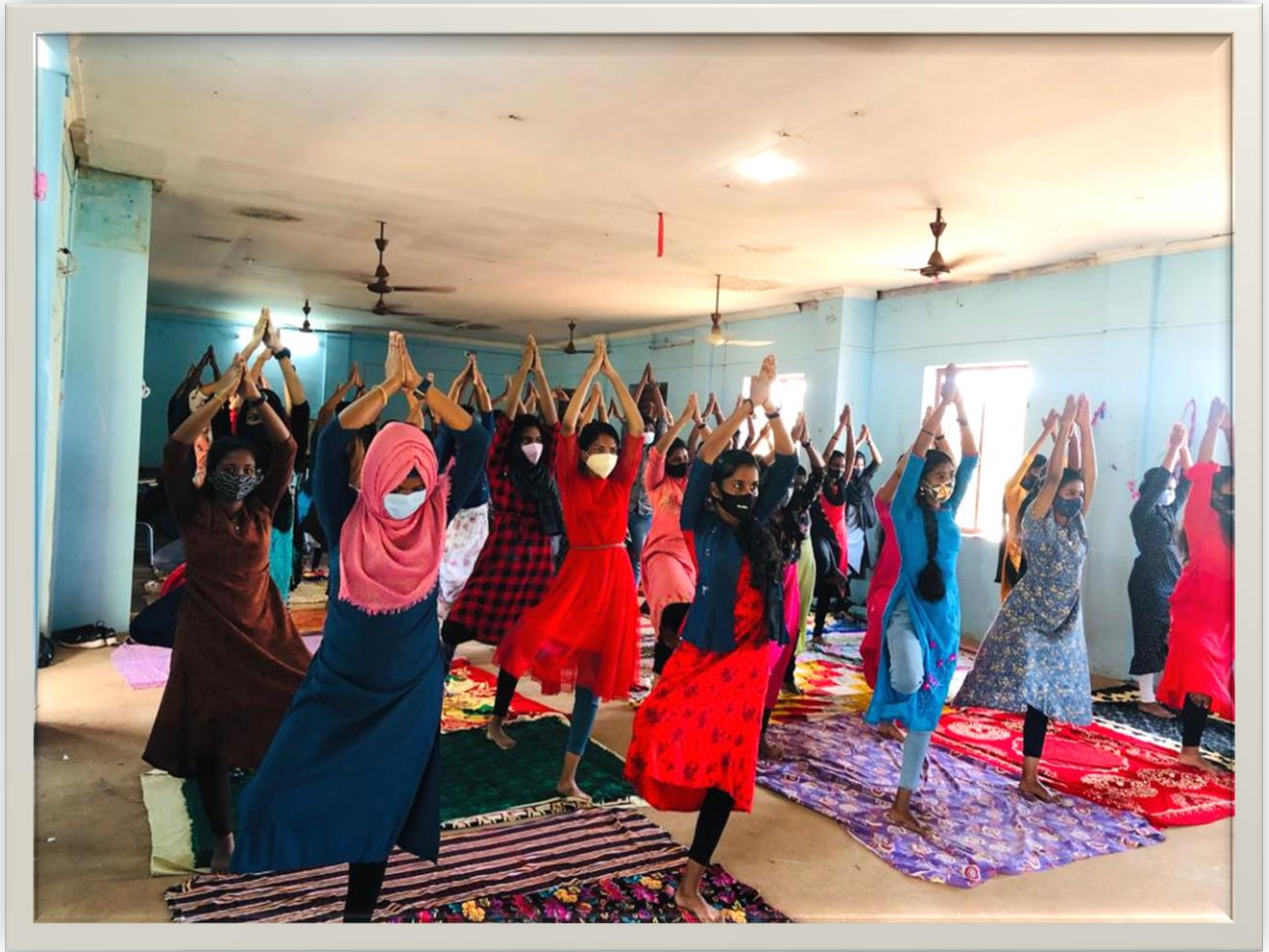
STUDENTS PERFORMING VRIKSHASANA