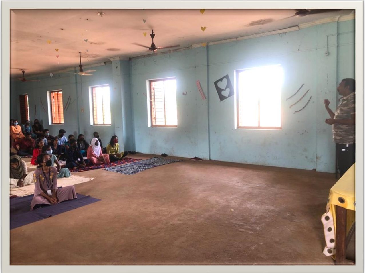
SRI. AMJITH.S handling classes