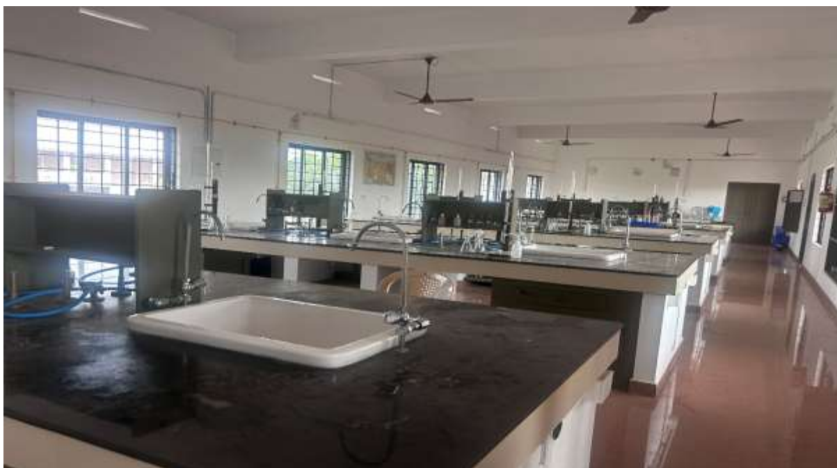
ORGANIC & INORGANIC LAB