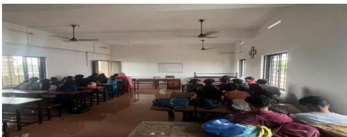
II B.COM CLASSROOM

The college conducts UG and PG classes in a well-furnished, ICT-enabled manner to enhance the learning experience. All classrooms are equipped with modern facilities such as projectors, podiums, and a speaker and microphone system. To ensure security and proper monitoring, all classrooms are under CCTV surveillance, overseen by the Principal. The classrooms are designed for comfort, featuring armrest chairs, proper ventilation, fans, and adequate lighting. These facilities create an environment conducive to effective teaching and learning. The college is committed to providing a modern, well-equipped infrastructure for students and faculty.