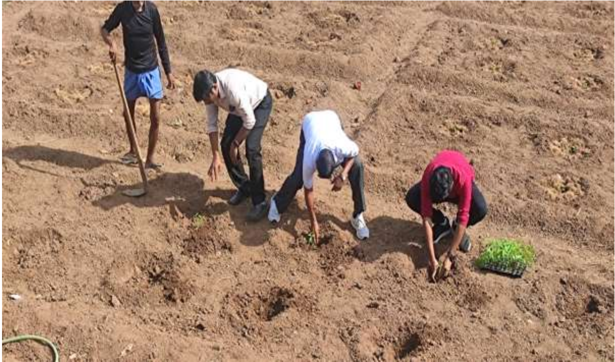
Faculties engaged in Sowing