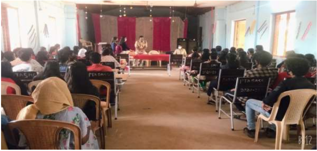
Training on Fire and Safety (Women Cell)