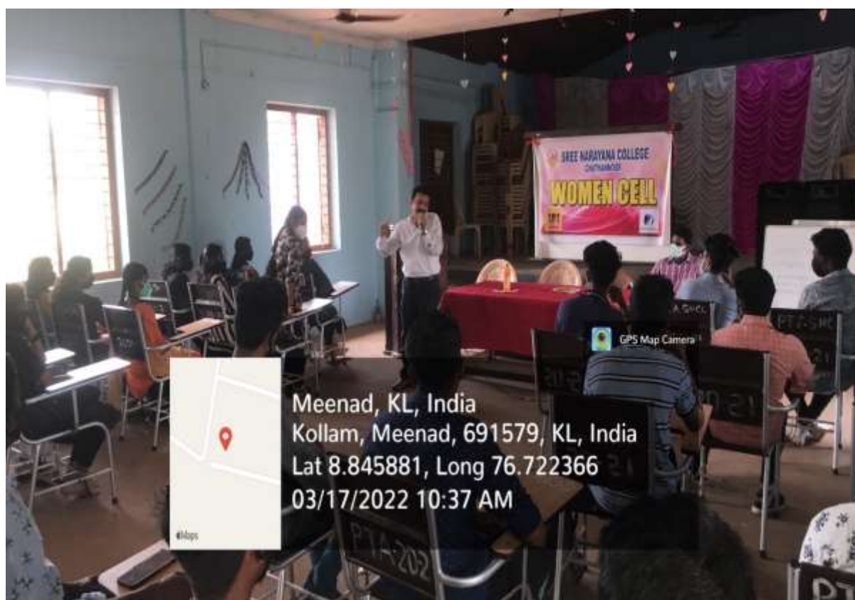
Personality Development Programme (Women Cell)

The college boasts a well-structured, multipurpose auditorium that serves as the venue for both academic and non-academic events. With a seating capacity of approximately 200, the auditorium is ideal for a range of functions and gatherings. It is equipped with modern audio-visual facilities, ensuring high-quality sound and visual presentations. The auditorium is fitted with a projector and an effective light and sound system to enhance the overall experience of events. Major college functions, cultural activities, and competitions are regularly held here, providing students with a platform to showcase their talents. It offers a diverse range of opportunities for students to participate in performances and events, helping them develop their skills. The auditorium also plays a key role in the holistic development of students by encouraging creativity and expression.