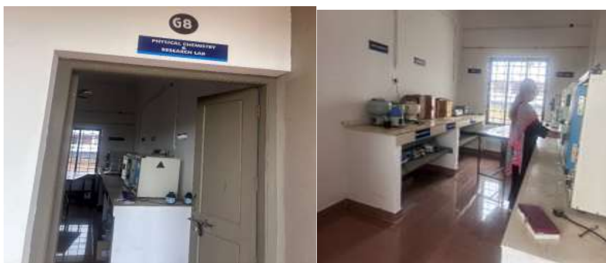
PHYSICAL CHEMISTRY & RESEARCH LAB

The college provides adequate laboratory facilities for all science departments to support practical learning. The laboratories are spacious, well-planned, and designed to meet the needs of both students and teachers. The Physics and Chemistry laboratories are particularly well-equipped with advanced tools and apparatus for experimental work. These laboratories are regularly updated to keep pace with new developments in science and technology. The college aims to provide a comprehensive and effective learning environment through its well maintained laboratory infrastructure .