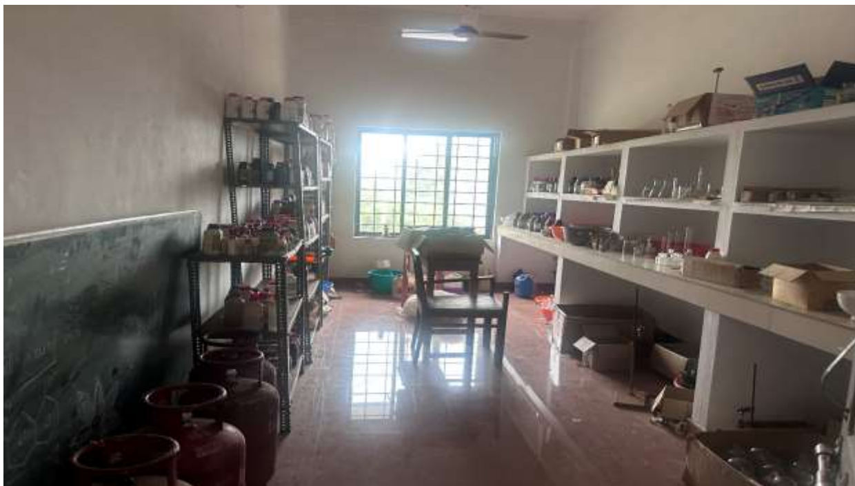
STORE ROOM (CHEMISTRY LAB)