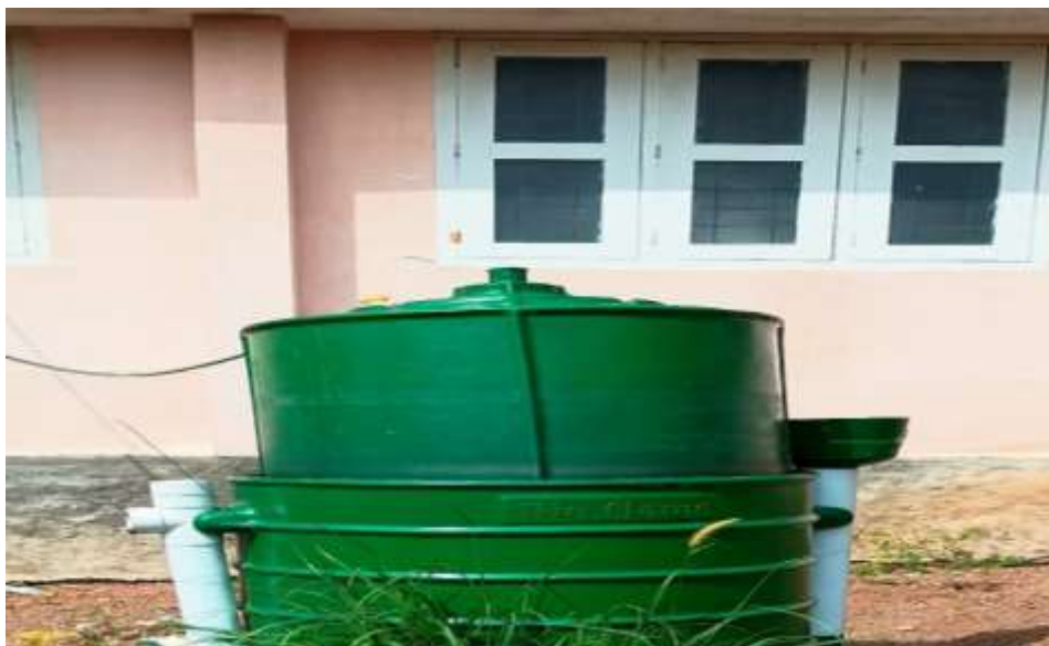
RAMP FOR DISABLED