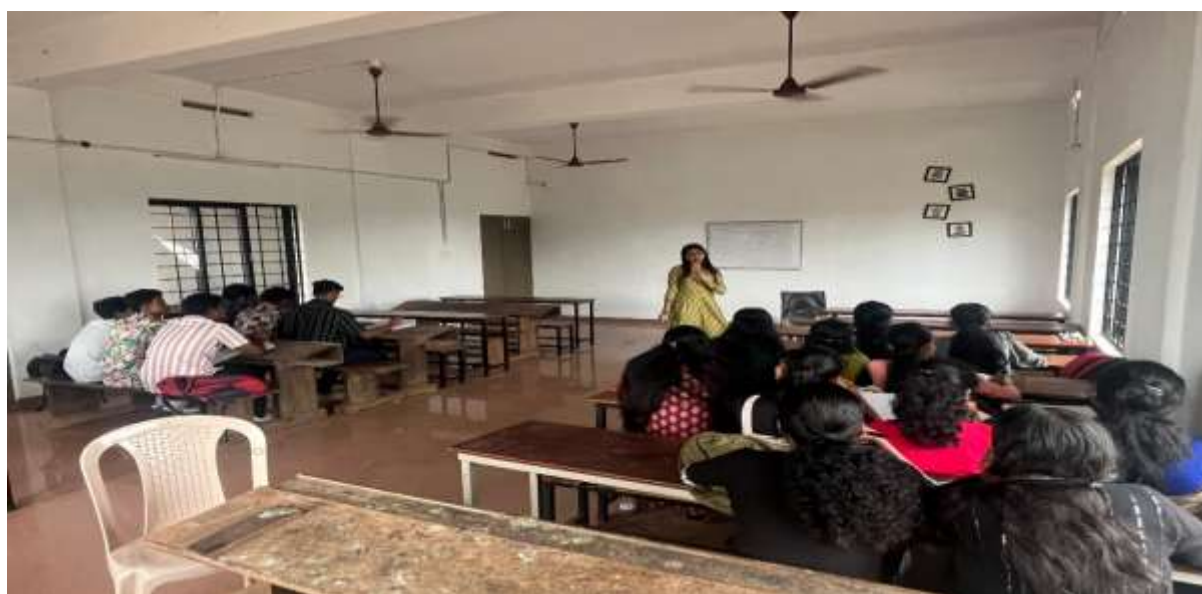
III B.COM CLASSROOM