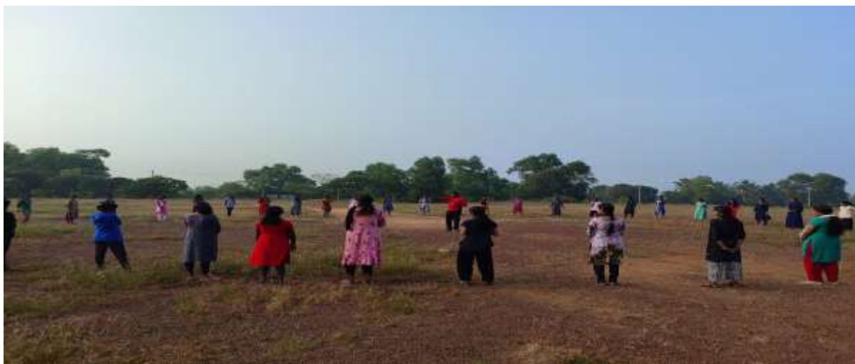
PRACTICE SESSION( SPORTS)