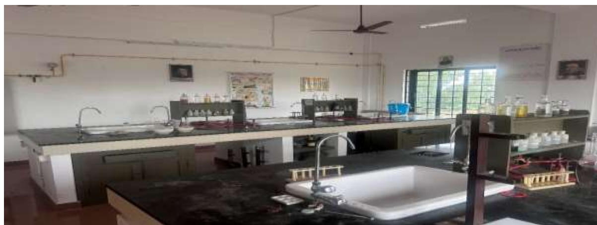
INDUSTRIAL CHEMISTRY LAB