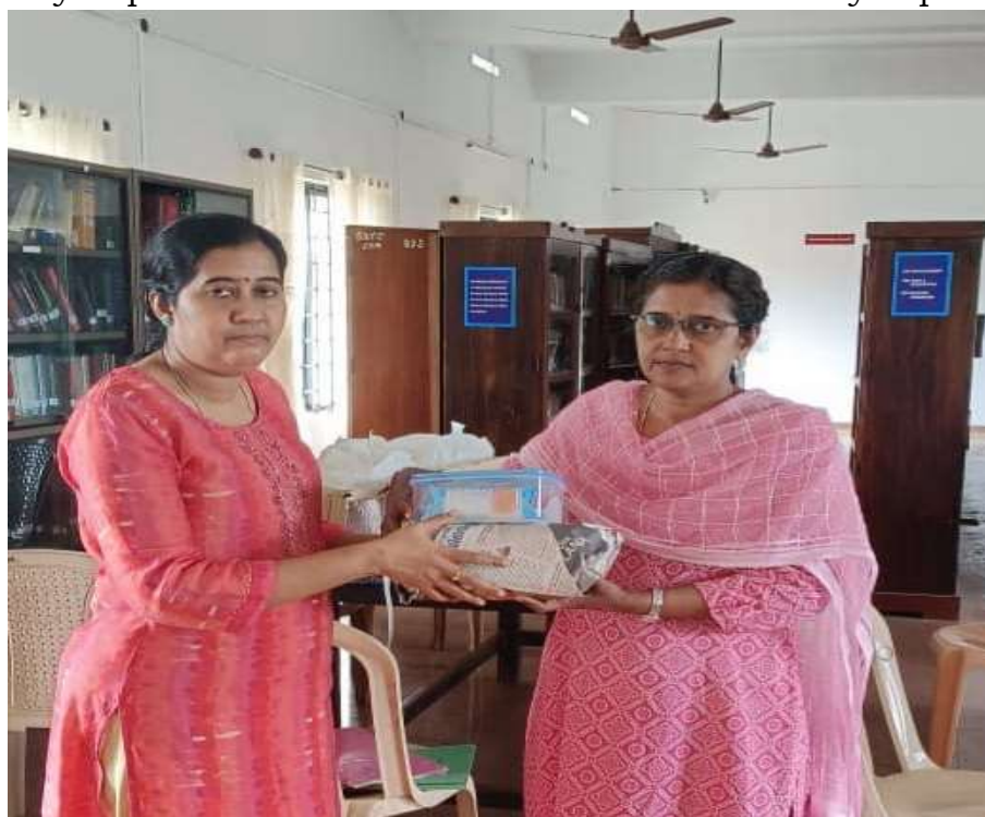
Sanitary napkin and first aid kit distributed to Chemistry department