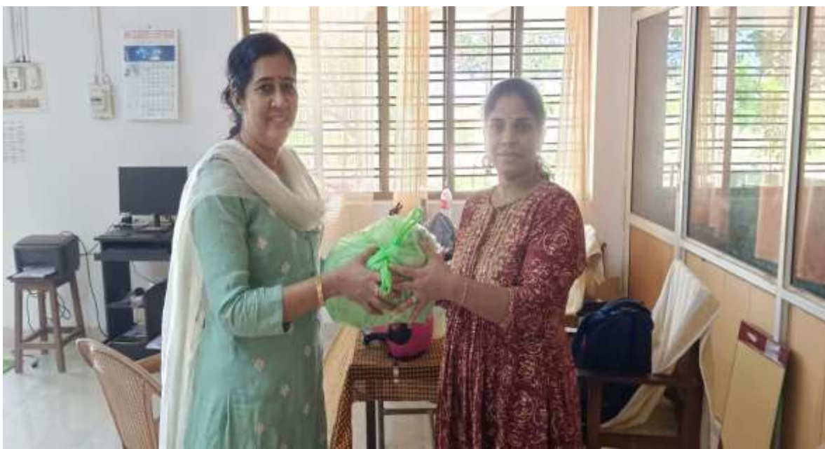
Sanitary napkin and first aid kit distributed to History department