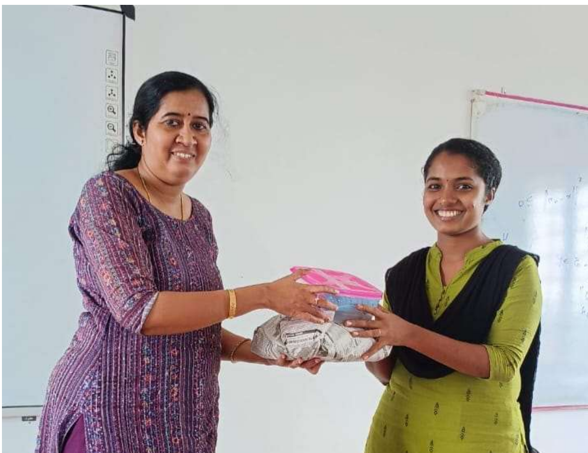
Sanitary napkin and first aid kit distributed to maths department

The department heads of college had formally requested the procurement and distribution of sanitary napkins and first aid kits for girls. This initiative aims to support female students by providing essential health and hygiene products. Supplying sanitary napkins will help students manage menstrual hygiene without financial burden, while first aid kits will ensure readiness for minor health issues. The request highlighting the importance of this support in fostering a safe and supportive environment for female students. The women study unit take initiative to take purchase sanitary napkin& first aid kits and distributed to all HODs of department for girls students.