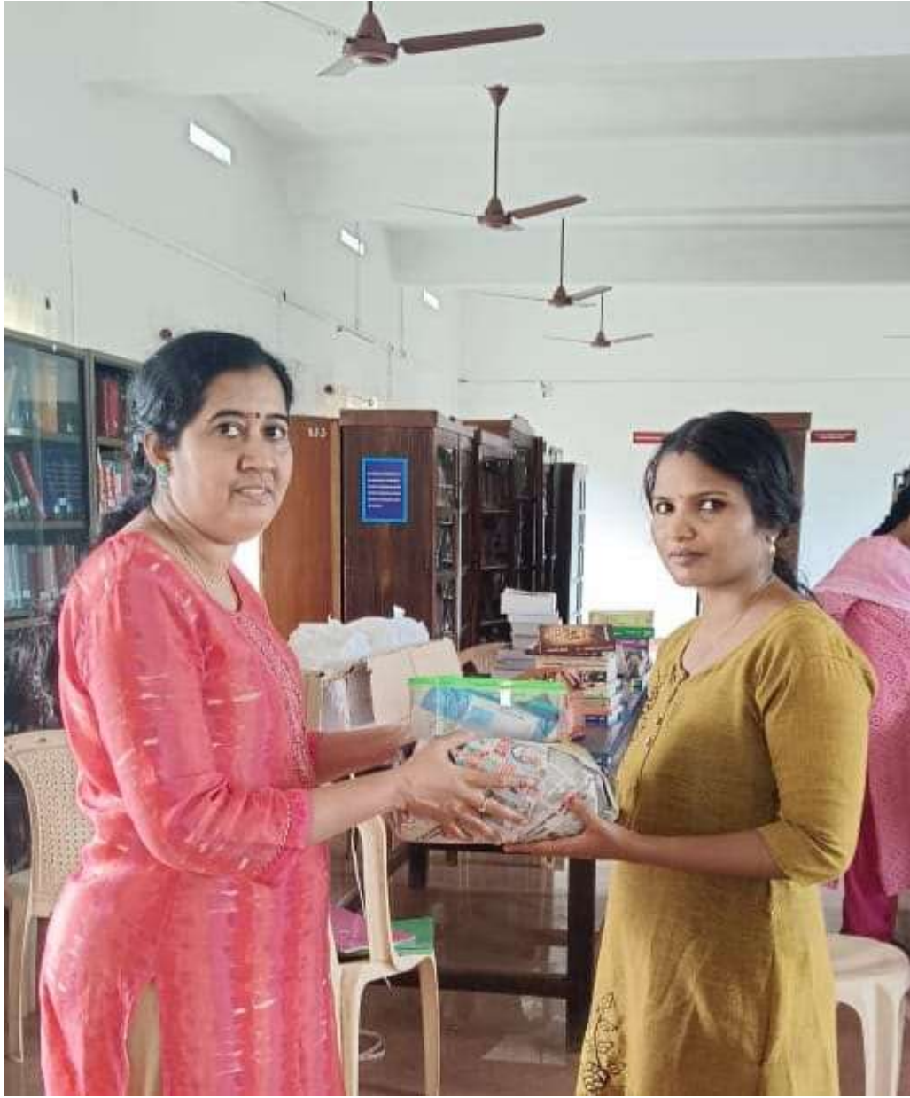
Sanitary napkin and first aid kit distributed to Commerce department