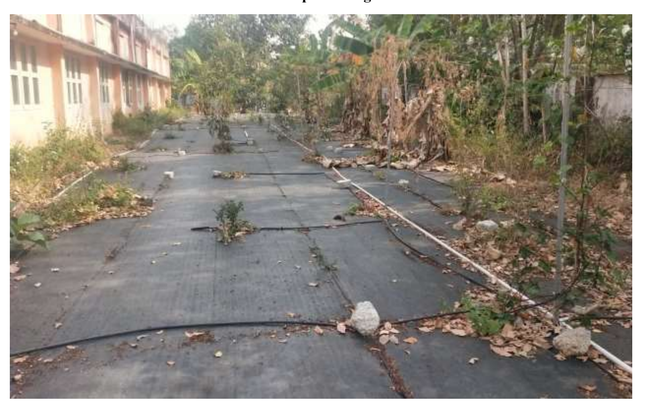
Waste Water Recycling