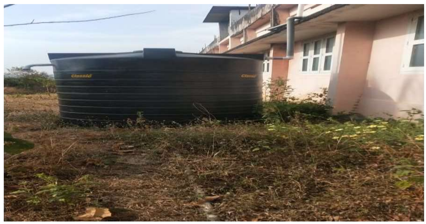
Roof top catching