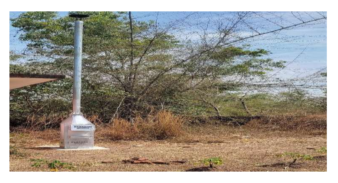
Solid Waste Management System.